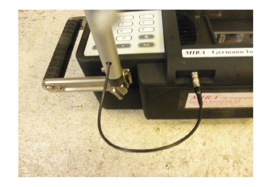
Fig.2. Activation button in the operation handle Fig.3. Connector jack attached to the MIRA